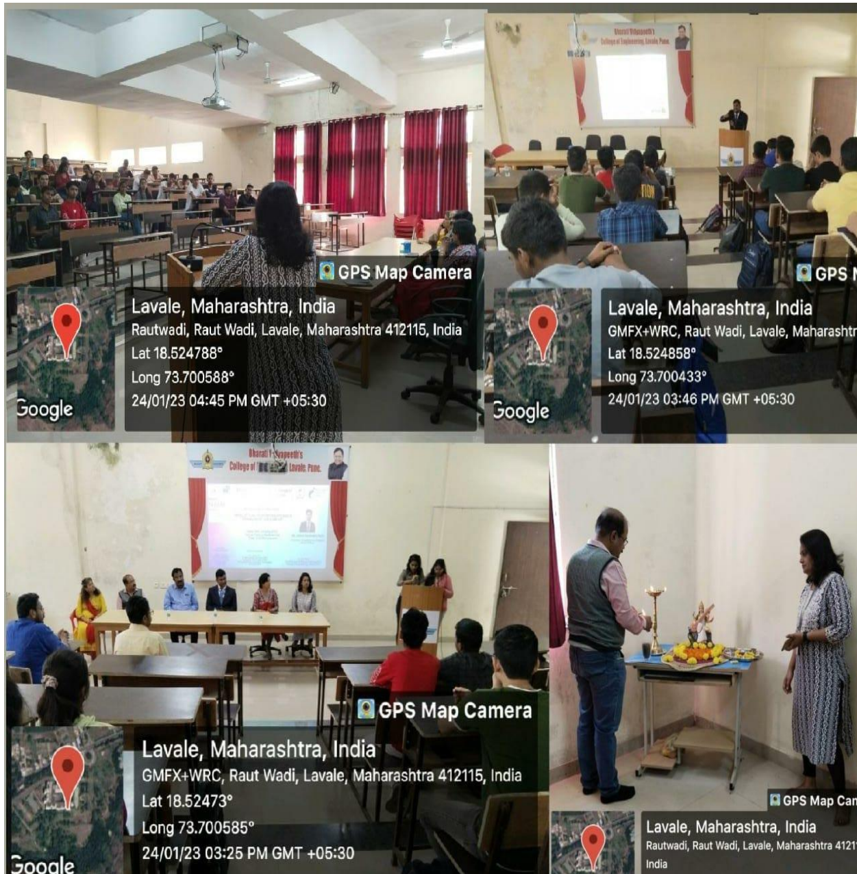
E-Cell, Bharati Vidyapeeth's College of Engineering Lavale Pune had organized a Session on “Intellectual Property Rights (IPR) & IP Management for Startup” on 24th Januray 2023.