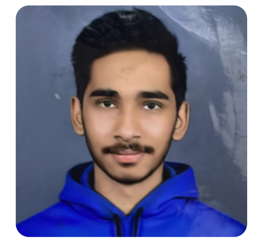
Preet Ikhar Solar Square Energy 4 LPA

Placed students - Mechanical Department (2024-25