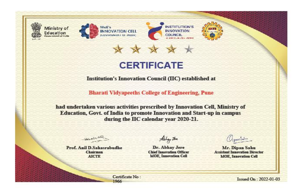
4/4 in the academic year 2020-21