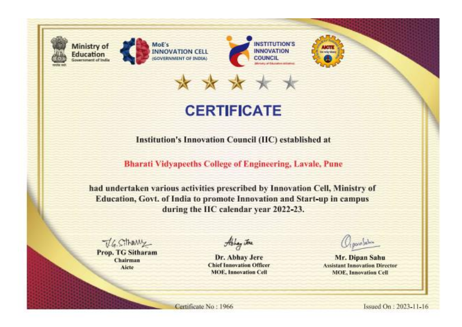
3/4 in the academic year 2022-23