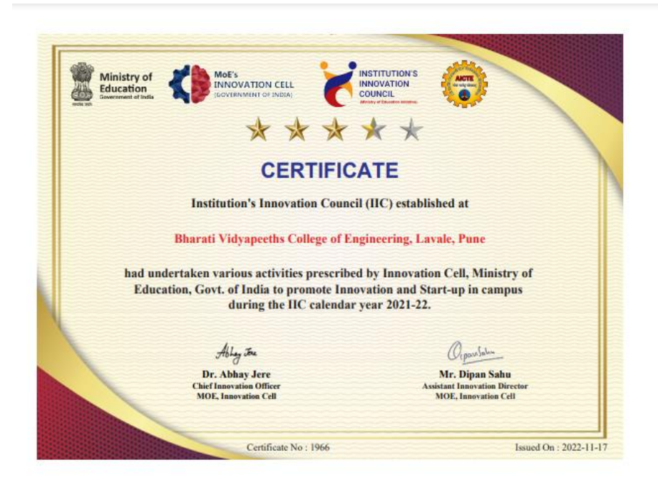
3.5/4 in the academic year 2021-22