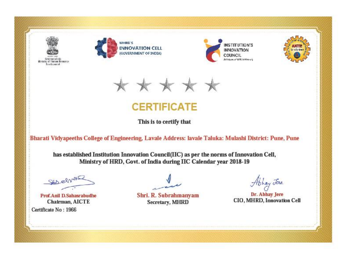
MHRD-IIC Council -Establishment certificate 2018-19